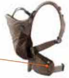
Stokke® MyCarrier™ Placed in the harness pocket. Stokke® MyCarrier™ Cool Placed on waist belt.