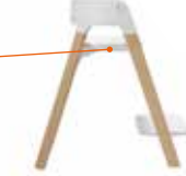
Stokke® Steps™ Chair Placed under the seat and on the packaging.