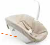
Tripp Trapp® Newborn Set Placed under the product and on the packaging.