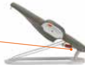
Stokke® Steps™ Bouncer Placed under the product and on the packaging.